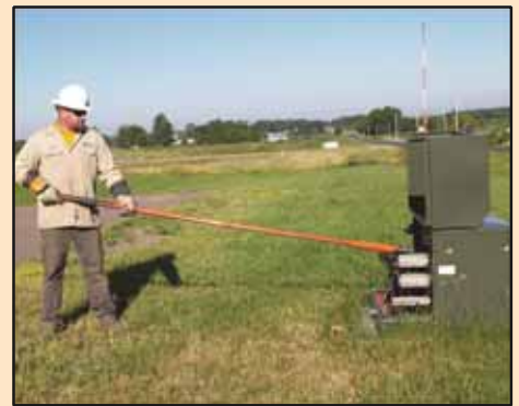
The 12-foot clearance in the front of the utility box allows crews to safely access energized equipment.

Please permanently remove or relocate all obstructions from an area within 12 feet from the front (side with the lock) and four (4) feet on all other sides of the ground-mounted utility equipment (green box). At the time of inspection, any obstructions within this area may be removed by Karcz or their work postponed until the area is clear. Before doing any digging, you must call 800-242-8511 for a free service to locate the utility-owned underground lines in the area.