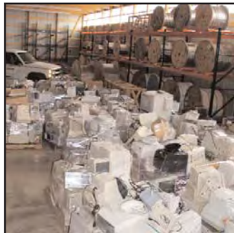
Over 450 pieces of computer equipment crowd the floor awaiting pick up after the April 20th recycling blitz.

Croix Electric through the Enviro-Clean program, which also accepts batteries and fluorescent bulbs and tubes. Computers are recycled at a cost of $7.50 per piece for co-op members, $12.50 per piece for non-members. Batteries are recycled at no charge to members. Non-members can recycle alkaline and ni-cad batteries at no charge, lithium batteries at $3.00 a pound, and mixed batteries at $1.00 per batch. Fluorescent tubes are recycled at no charge, compact fluorescent bulbs are recycled at $1.35 each for members, $2.00 each for non-members.